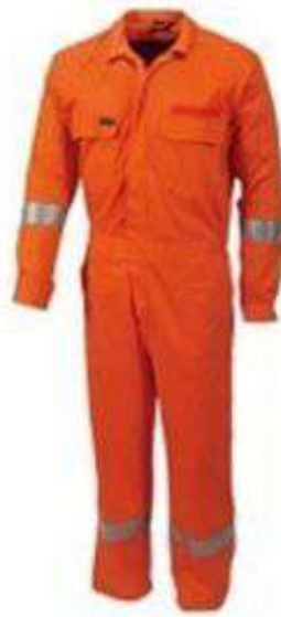
Hiviz Coverall 9894