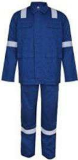
Jacket Trousler Set 7874